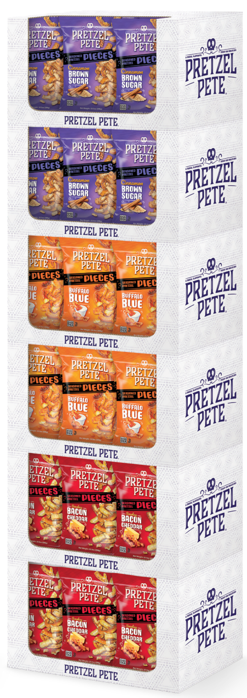
Example Six Case Stack

Our most indulgent line! Our broken pieces pack a wallop of flavor that will satisfy even the biggest snacker in the house.