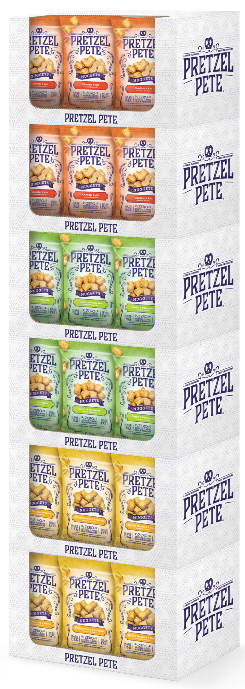
Example Six Case Stack

Seasoned pretzel nuggets were our very first product line and are still one of our bestselling! These bite-sized nuggets have a softer texture than most pretzels and are easier on the teeth.